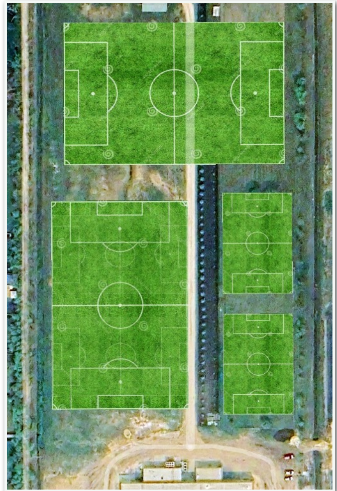
Conventional Sand-Based Athletic Field